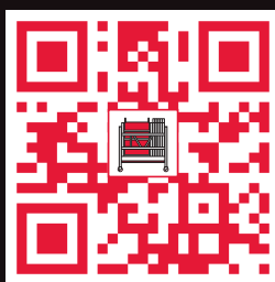
SCAN TO SEE MORE