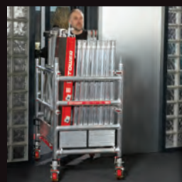
EASY TO MOVE