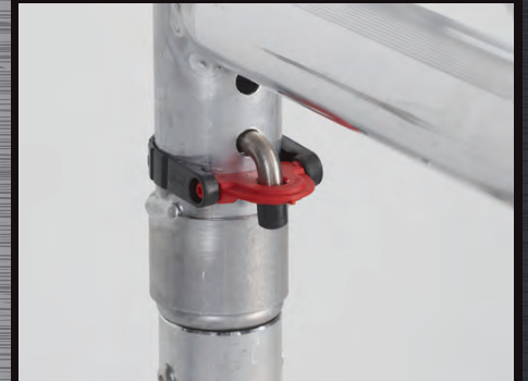
Easy-clip frame clips