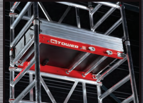
Strong & Robust