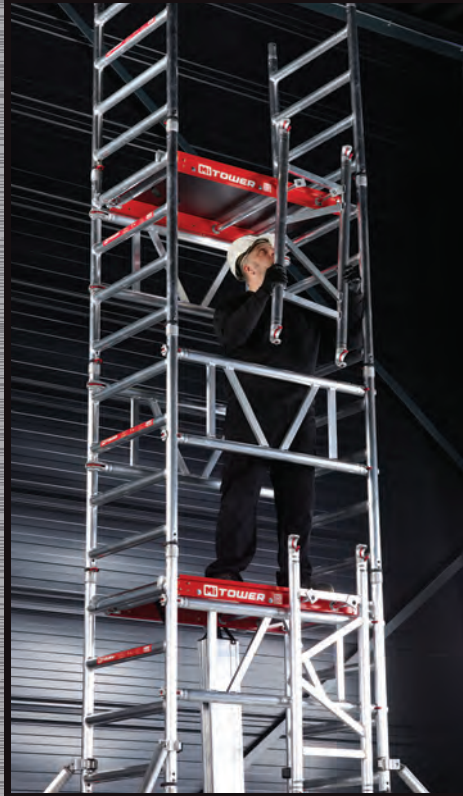
One Man Use