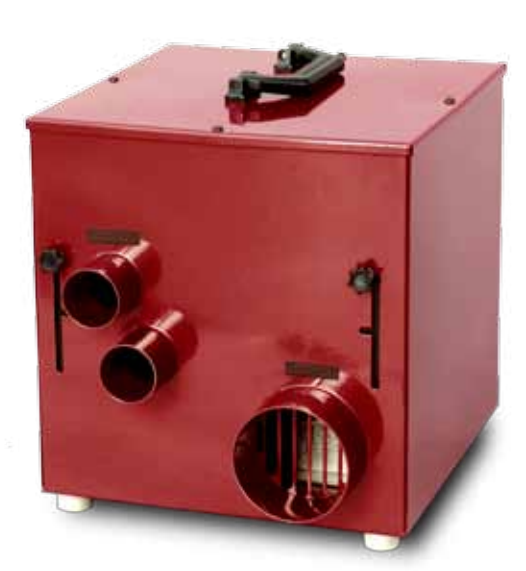
Dry air outlet, two \varnothing 50 mm and one \varnothing 100 mm